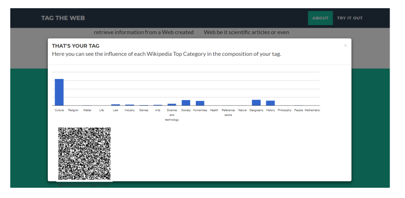
Fig. 1. Categorization for a given page of Obama's twitter